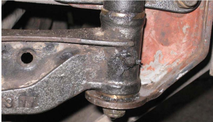
Aftermarket Idler Arm and Idler Shaft with Modified Aftermarket Idler Arm Brace